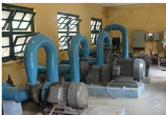
Figure 8 Pumps used in the second pumping station