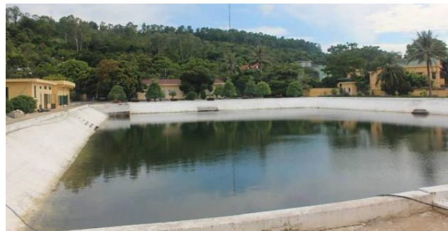
Figure 3 Do Son raw water reservoir

This reservoir consists of an area of 2,800 m 2 and has a volume of 8,000 m 3 (Figure 3). The water level is in range of 1.0 – 2.8 m and has a retention time is 20 hours in the case of operation capacity of 250 m 3 /h.