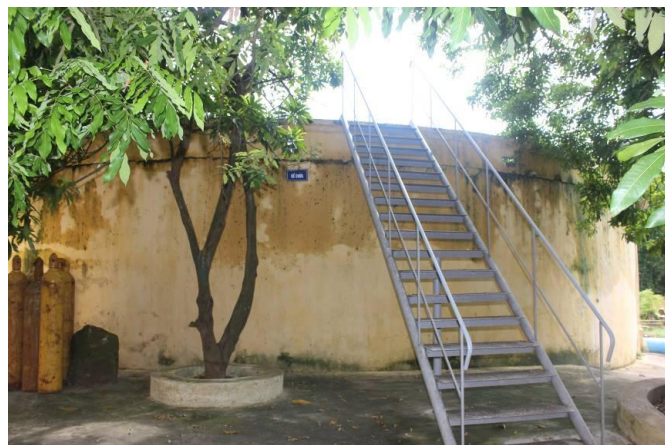
Figure 7 Pure water storage tanks

DSWTP consist of a clean water storage tank with a volume of 1,000 m 3 . The liquid chlorine is injected into water pipeline which conveys water to the storage tank. It has a retention time of 30 min.