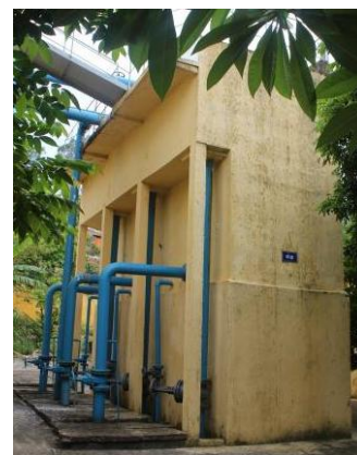
(b) Vertical filtration tank