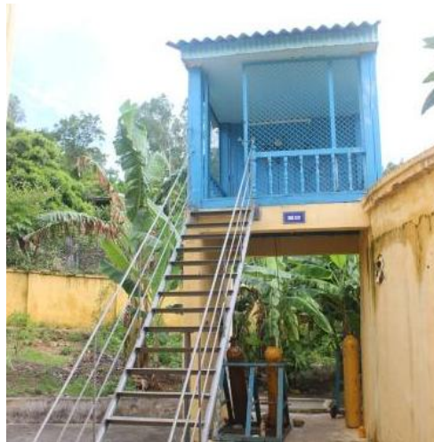
Figure 6 Filtration tanks

The liquid chlorine ( Figure 6 ) is used for the disinfection and the quantity to be used is determined from the Jar test performed in the technical quality room. The residual (free) chlorine in treated water is tested by DPD tablets or Orthotolidin solution. There are two chlorinators with the capacity of 2 kg/hr.