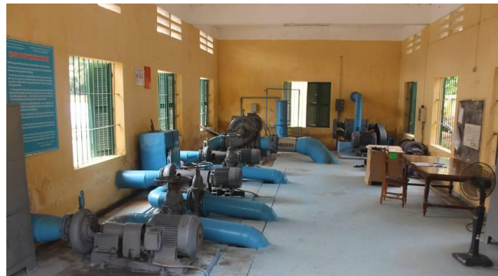
Figure 4 Do Son raw water reservoir