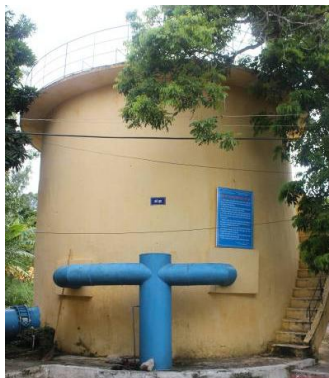
(a) Circular filtration tank

DSWTP utilizes anthracite carbon (0.5 m) and silica sand (0.7 m) as filter media and has a filtration rate of 8-10 m/h. DSWTP has a circular filtration tank with the surface area of 28 m 2 and a rectangular filtration tank consisting of three segment, each with an area of 3.4 m 2 .