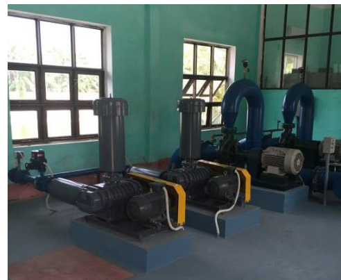
Figure 5 Pumping station