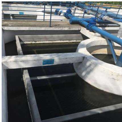
Figure 3 Sedimentation tank

VBWTP consists of vertical sedimentation tank with the capacity of 849 m 3 . The tank consists of four sections ( Figure 3 ), each with the dimension of 5.2m x 5.2m x 3.98m (L x B x H). The tank has the retention time of 3 h.