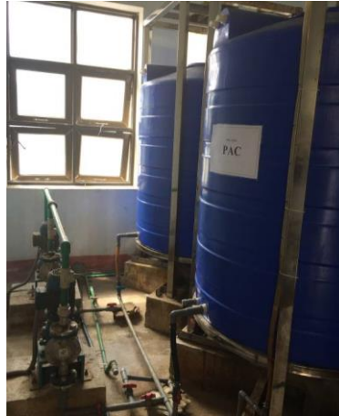
Figure 2 Chemical Building

There are two mixing tanks and one solution tank with the total volume of 1.45 m 3 . The average concentration of solution is around 5 %. The mixer operates with the capacity of 0.4 KW and 81 rpm speed. There is a metering pump which has two entrances with a flow rate is 0.6 m 3 /h. This pump is used to transfer chemical solution to the mixing tank.