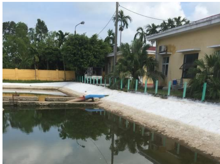
Figure 1 Pre-sedimentation tank

The pre-sedimentation tank ( Figure 1 ) has an area of 1,600 m 2 and volume of 6,000 m 3 . The water level varies in the range of 1.0-3.7 m. The retention time is 48 hour in the case of production capacity of 2,500 m 3 /d.