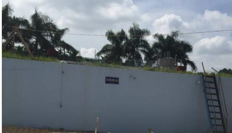
Figure 6 Pure water storage tank

There is a purified water storage tank ( Figure 6 ) with the capacity of 500 m 3 . Chemical disinfectant is added in the water pipeline before it ends up in the storage tank. The chemical contact time for this process is around 120 min.