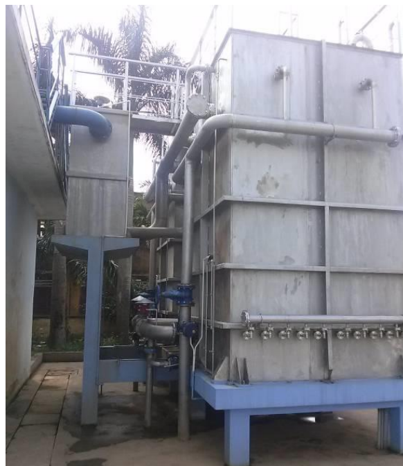
Figure 8 Biological Contact Filter

Biological Contact Filter (BCF, capacity: 5,000 m 3 /d) was installed in 2014 with the help of JICA donation ( Figure 8 ) for the nitrification purpose and partially treatment of organic pollutants.