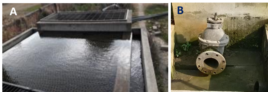
Figure 3: (A) Tube Settler Unit and (B) Drain pipe for Tube Settler

The sludge from the tube settlers during the cleaning operation is collected through a drain pipe located at the bottom of the Tube Settler unit ( Figure 3B ). The sludge generated is collected and disposed of in the open fields near the treatment plant.