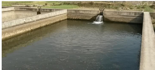
Figure 4: Slow Sand Filter

The effluent after sedimentation is treated by slow sand filtration (SSF) unit with a dimension of 12 length, 8 m breadth, and 3 m depth and with media depth of coarse gravel - 50 cm, fine gravel- 40 cm and sand - 90 cm. The designed filtration or loading rate of all three filter units is 3.0 \text{ m}^3/\text{m}^2/\text{d} while the current loading rate of two filter units is 3.6 \text{ m}^3/\text{m}^2/\text{d} . There are two operational SSF at SWTP and the standby SSF is alternated with the SSF which undergoes cleaning process. SSF are cleaned every 15 days during the monsoon (June – August) when the turbidity is very high and in the normal circumstances (at normal turbidity) it is cleaned in every 1 – 1.5 months. The filters are cleaned manually by scraping the layer of sand from the top of the filter beds. The scrapped sand is washed and reused as filtration media. The generated wastewater is then discharged in the irrigation canal that distributes water to the nearby agricultural fields.