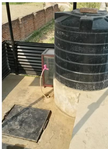
Figure 5: Chlorination Unit

The treated water is disinfected in drip chlorinator unit (Figure 5). There is a single chlorinator unit. The water treatment plant does not have a laboratory facility for water quality analysis. Bleaching powder is used for chlorination and dosing is based on an approximate calculation of 300 \text{ gm}/100 \text{ m}^3 of water, so, around 2.1 kg of bleaching power is consumed for 691 \text{ m}^3 per day. The calculated contact time is approximately 60 – 80 min (Contact Time, T = V_{\text{eff}} \times \text{BF}/\text{peak flow} , Baffling factor = 0.2, flow = 10 L/s, Effective volume ( V_{\text{eff}} ) = 250,000 \times 0.95 \text{ L} ).