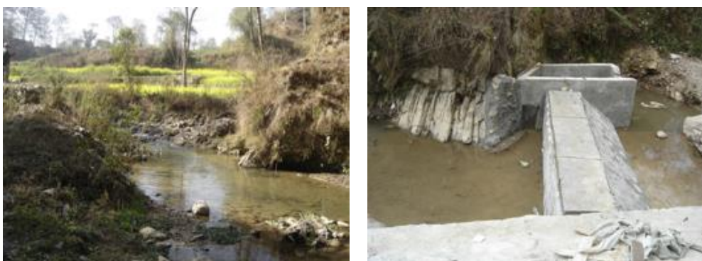
Figure 2: Catchment (left) and Intake works for SWTP at the Godavari river (right)

The surface water from Godavari River is being used as the main source of water supply for the SWTP. Figure 2 shows the catchment and the intake works of SWTP. The collected water at the intake is diverted to the WTP by a 3.5 km transmission using high-density polyethylene pipe of diameter 140 mm, with two air valves along the transmission line.