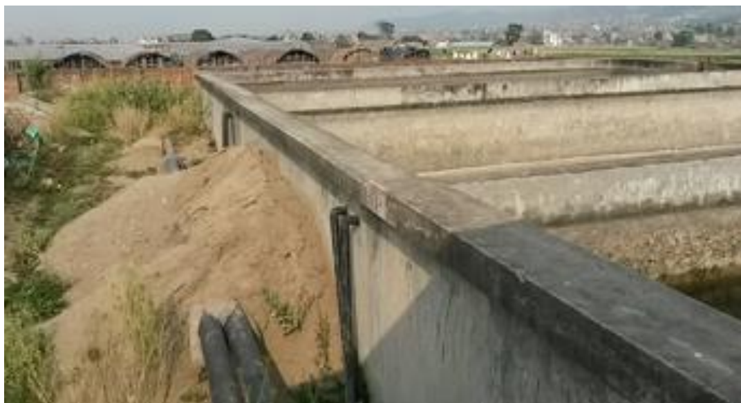
Figure 7: The waste sand deposit collected from slow sand filter

There is no sludge treatment facility at the SWTP. The primary sludge and/or sediment sand collected during the cleaning of SSF are stored inside the water supply facility ( Figure 7 ). The scrapped sand from the Slow Sand Filters are washed, cleaned and reused for SSF. It takes 2-3 days to clean the filter.