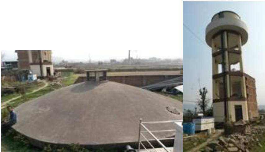
Figure 6: Storage tank (left) and Overhead tank (right)

The disinfected water is then stored in a single reservoir unit of 250 m 3 and then pumped to the overhead tank (50 m 3 ). During non-peak hours, the clean water stored in a ground reservoir can be distributed directly with gravitational flow through the distribution networks. The clean water from storage reservoir is pumped to the overhead tank which is utilized during the peak hours ( Figure 6 ). The water is then distributed to the residential areas.