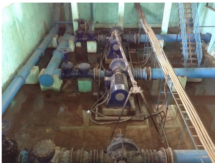
Figure 10: Booster pumping station at No. 8 Water treatment plant in Mandalay