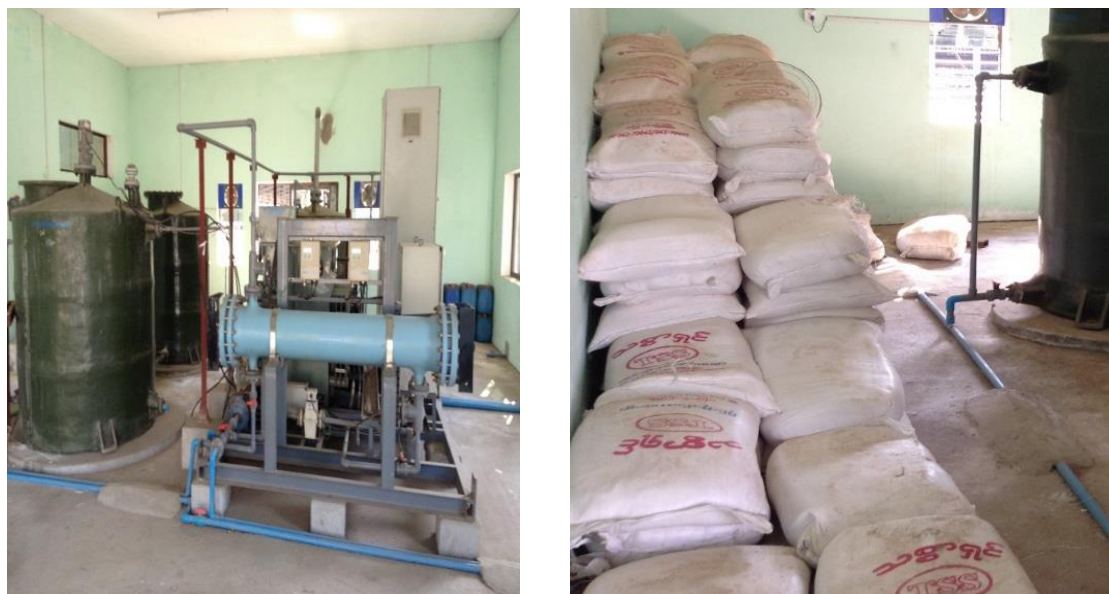
Figure 9: Electrolyzer (left) and salt bags for chlorination process (right)