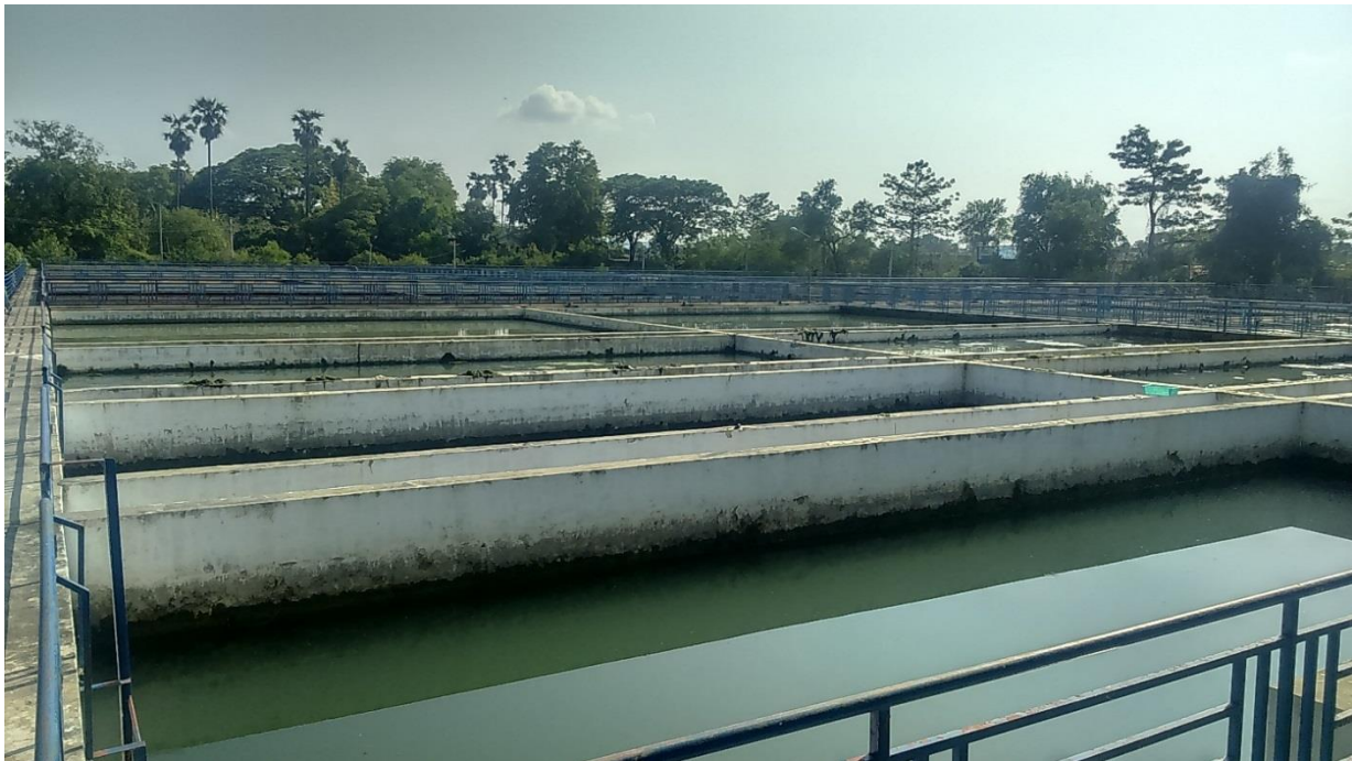
Figure 3: Pre-roughing filters