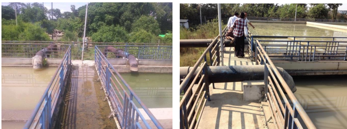
Figure 2: Water input to the pre-sedimentation tank