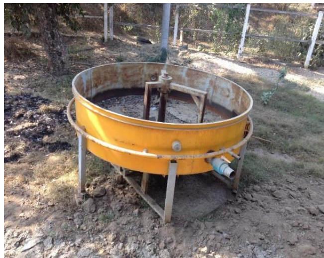
Figure 6: Filter media model for SSF unit (left) and locally made sand filter media washing machine (right)