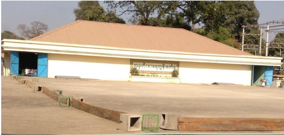
Figure 7: Clean water storage tank