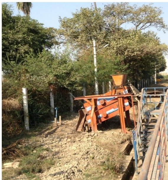
Figure 4: Screen vibrators for gravel media size separation