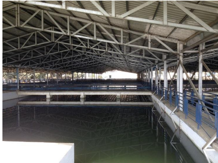
Figure 5: Slow sand filters