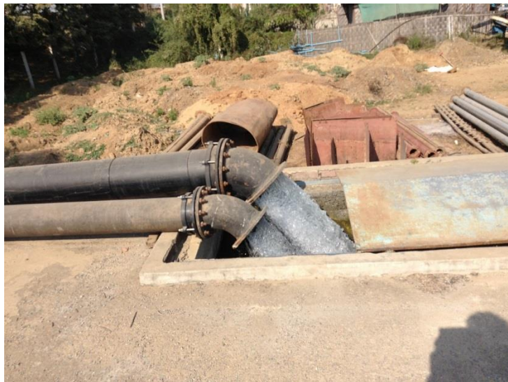
Figure 8: Ground water input to the clean water storage tank

Four ground water wells are constructed and used to supplement the requirement of the quantity of water for distribution. The ground water is pumped into the final clean water storage tank, where the chlorination also takes place. The ground water extraction rate is 190 m 3 /h (or 4560 m 3 /d) well, and the total ground water production from the four wells is 18000 m 3 /d.